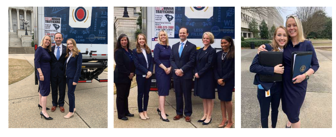
Upstate Human Trafficking Task Force With the Greenville County Sheriff's Office