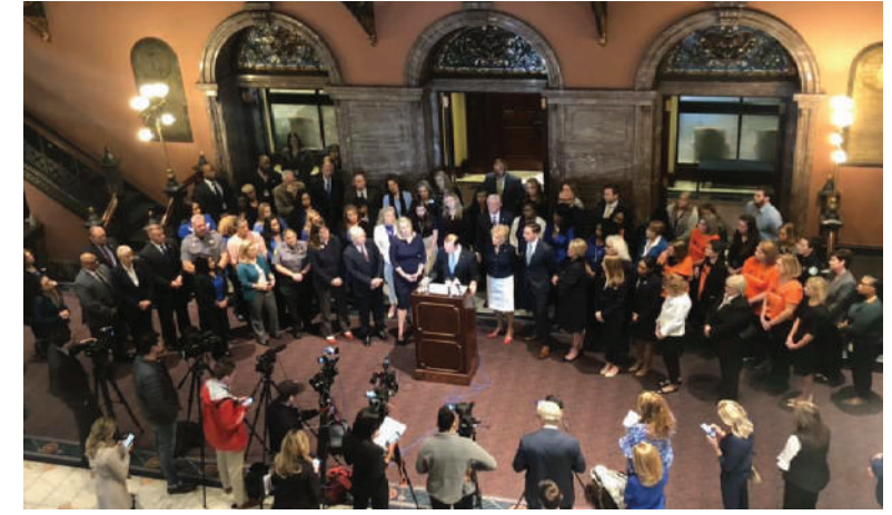
The Attorney General & Task Force members in the Statehouse for the release of the Annual Report

The State Task Force made great strides in 2019 in combating human trafficking in South Carolina. The Office of the South Carolina Attorney General would like to thank all the members of the South Carolina Human Trafficking Task Force for protecting community members, advocating on behalf of victims/survivors, educating members of the public and professional fields through numerous trainings and presentations, and supporting efforts to guarantee quality program services. Together, we continue to make progress in combating human trafficking in our state.