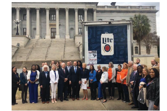
Task Force members stand behind one of many SC Beer Wholesalers Association trucks that feature posters with the National Human Trafficking Hotline number to help bring awareness this month.